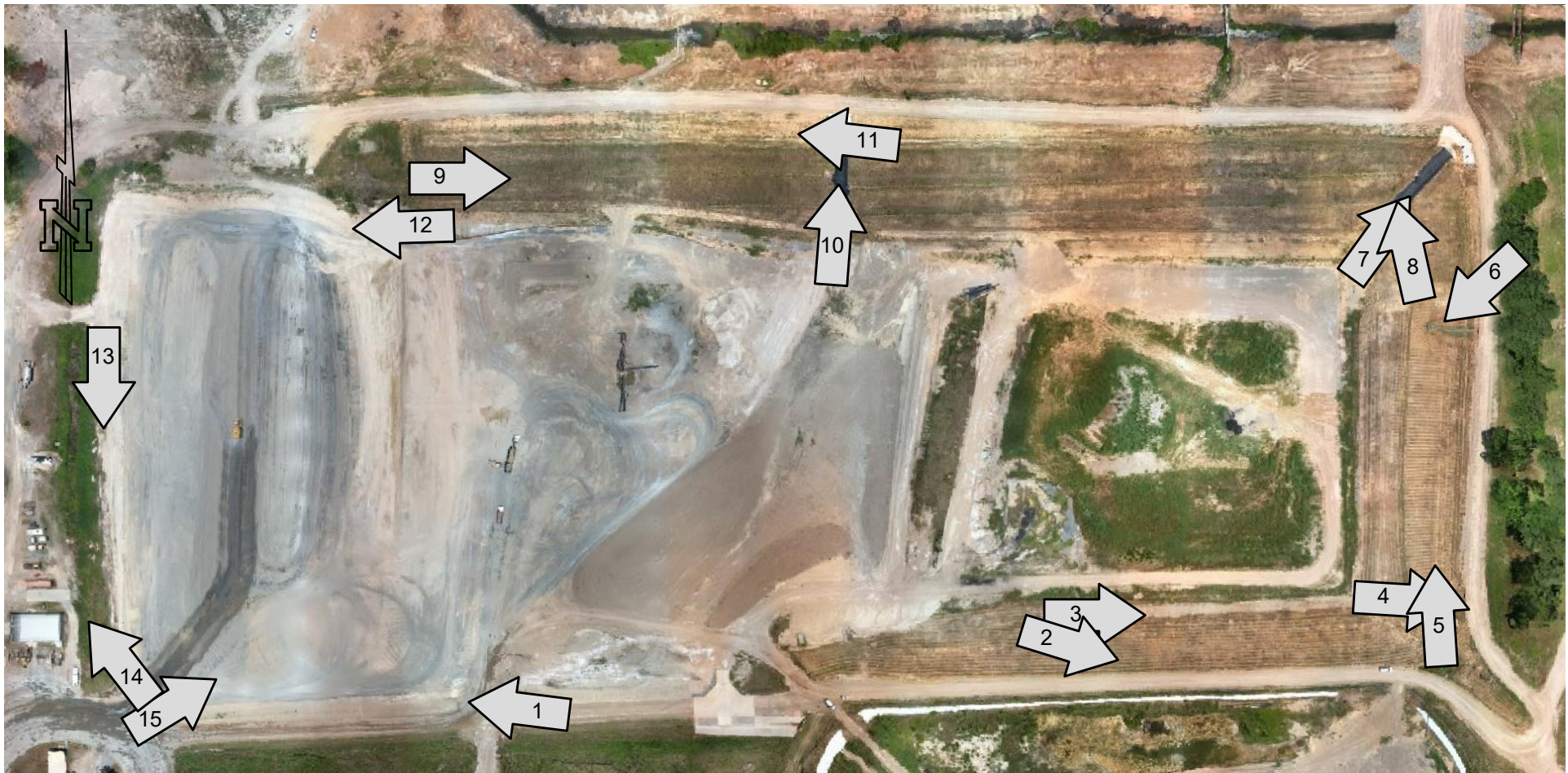
FIGURE 3 - INSPECTION PHOTOGRAPH LOCATION MAP CCR LANDFILL, WELSH POWER PLANT, CASON, TX