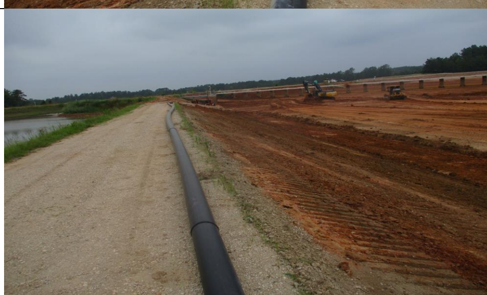
Photograph No. 3 Portion of the dike excavated due to pond closure activities.