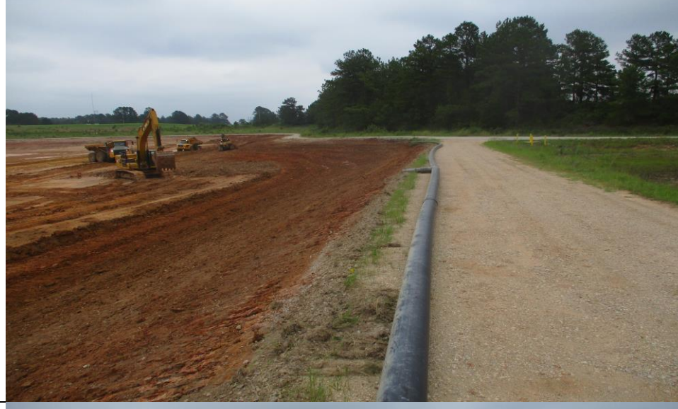
Photograph No. 2 View of the south dike crest and upstream slope (looking west).